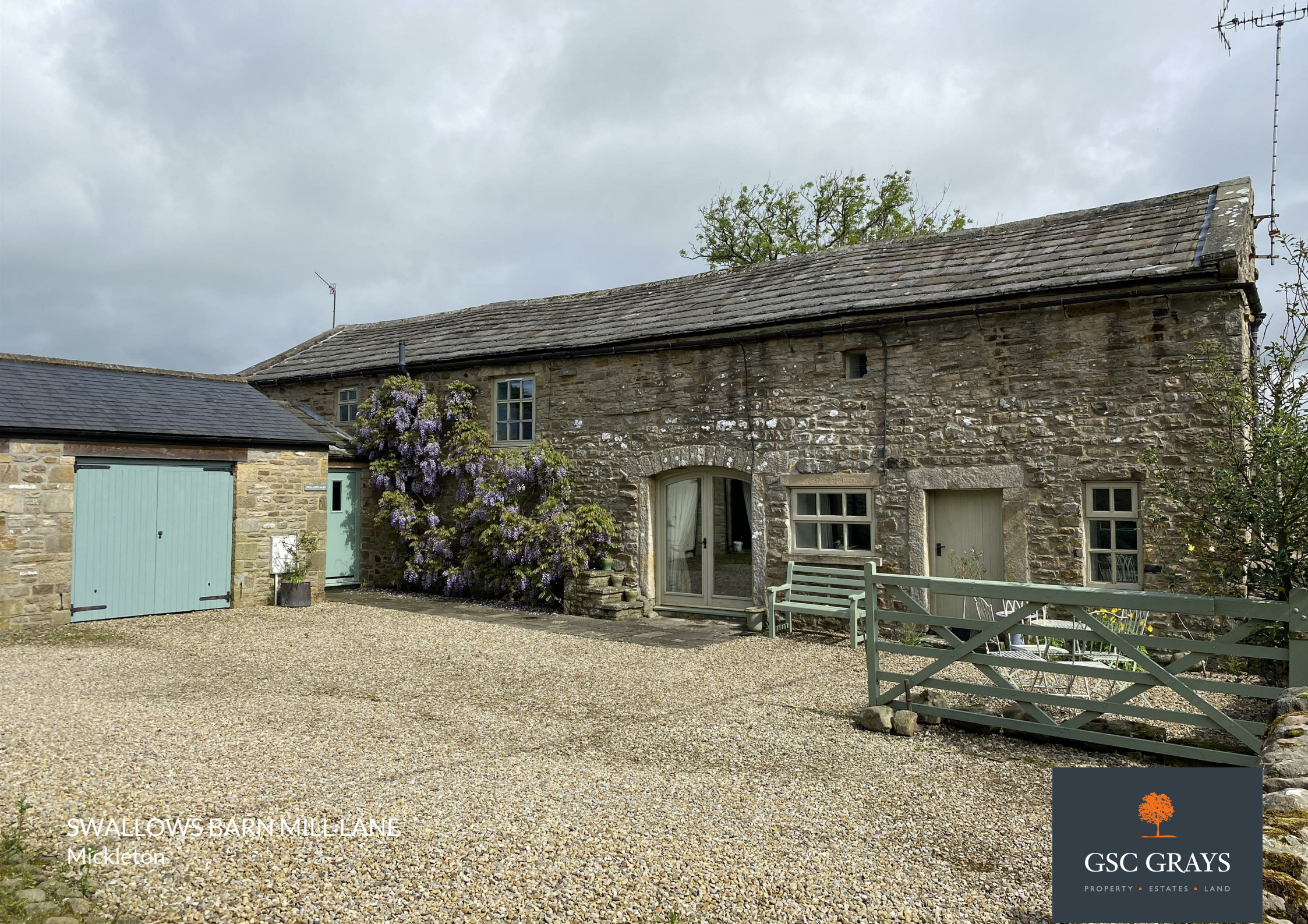
SWALLOWS BARN MILL LANE Mickleton