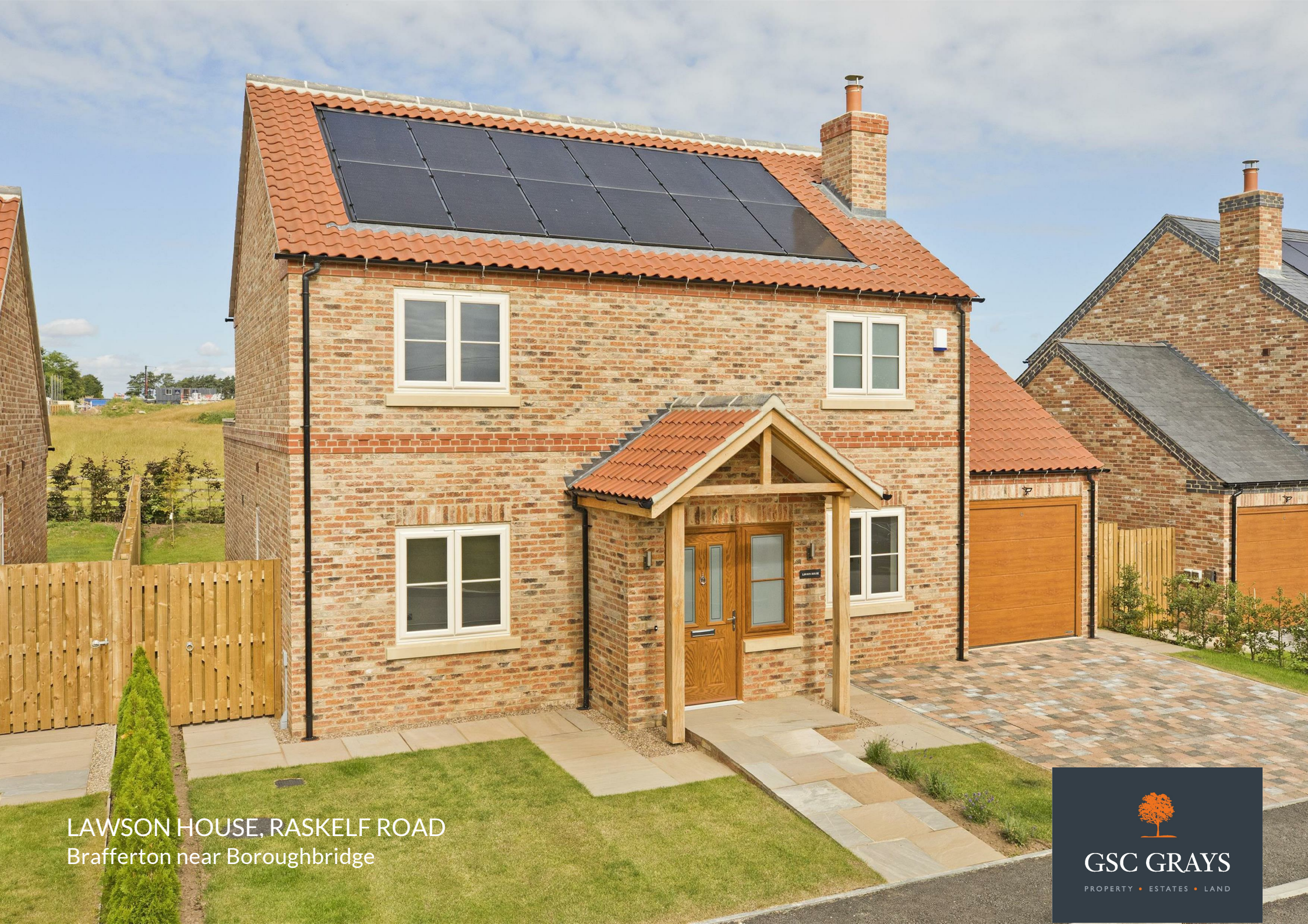
LAWSON HOUSE, RASKELF ROAD Brafferton near Boroughbridge