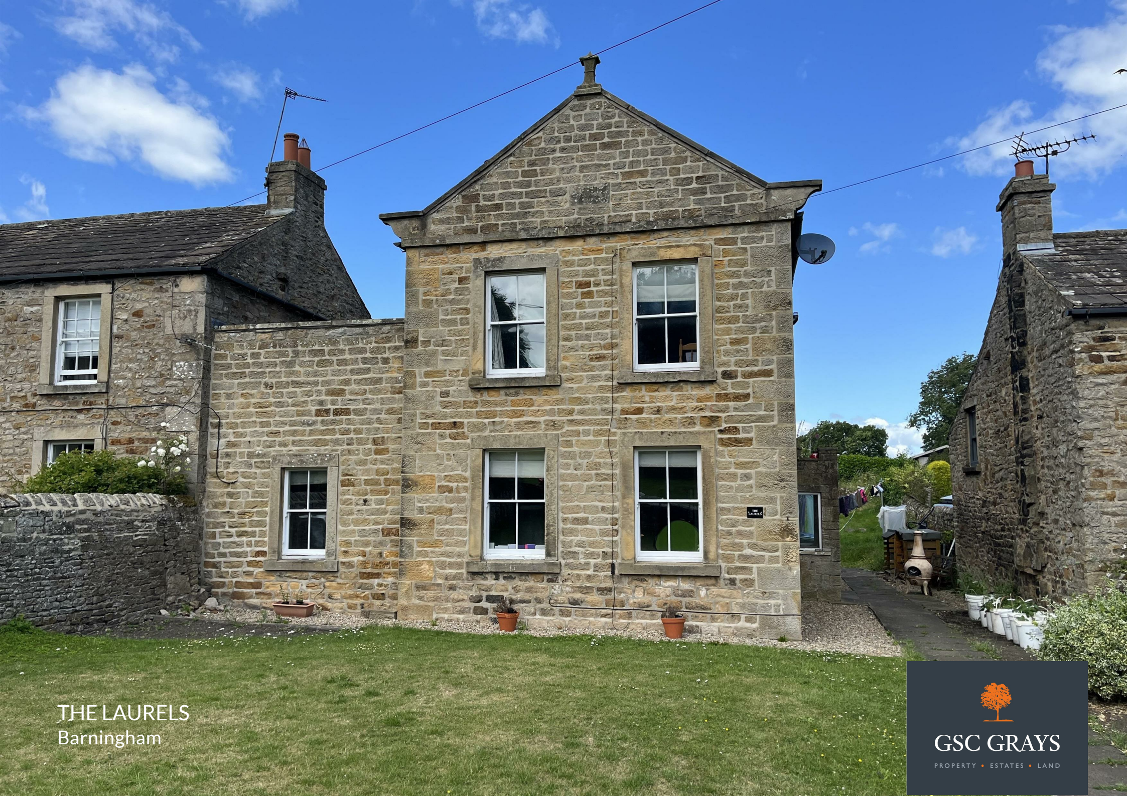
THE LAURELS Barningham