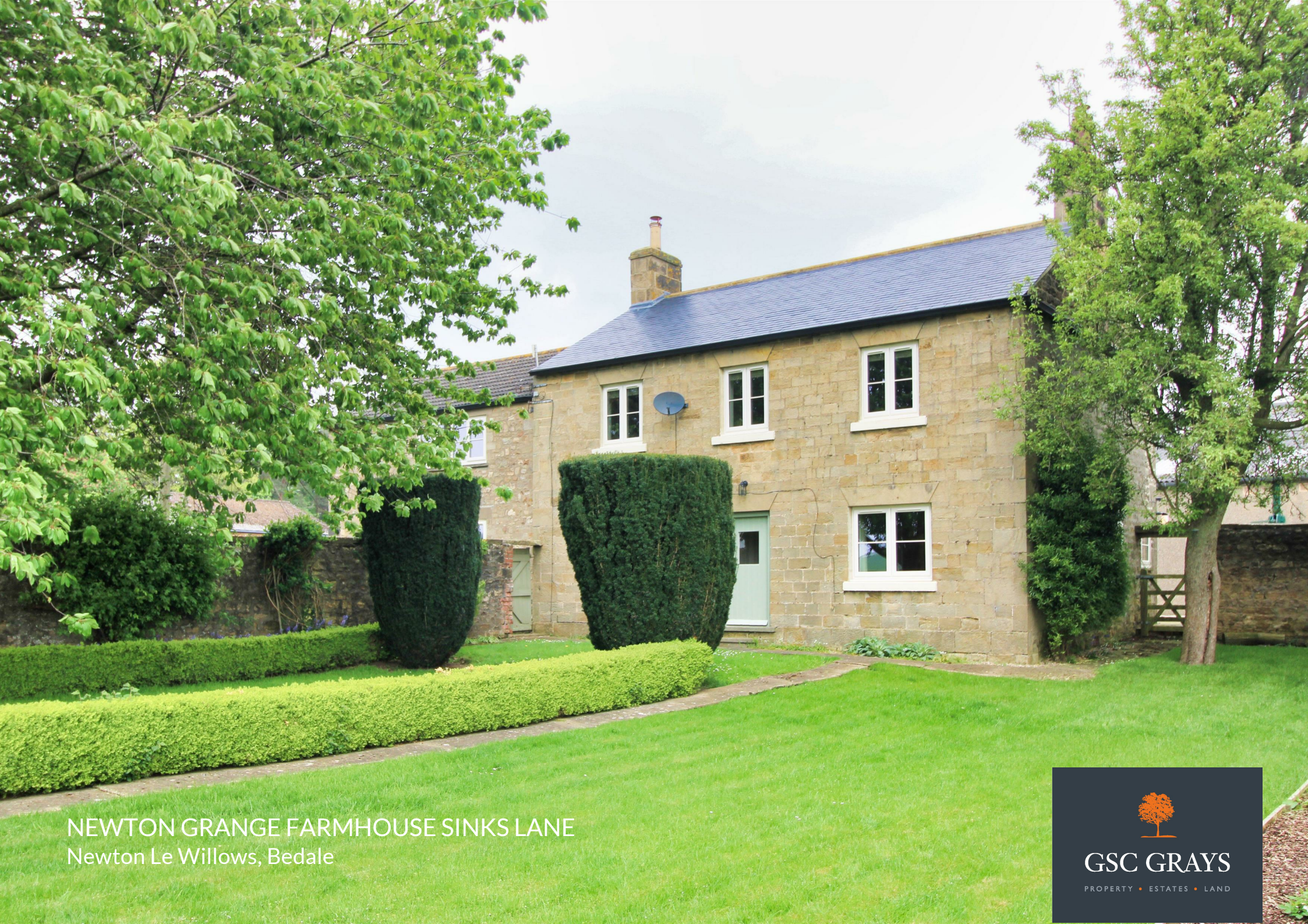
NEWTON GRANGE FARMHOUSE SINKS LANE Newton Le Willows, Bedale