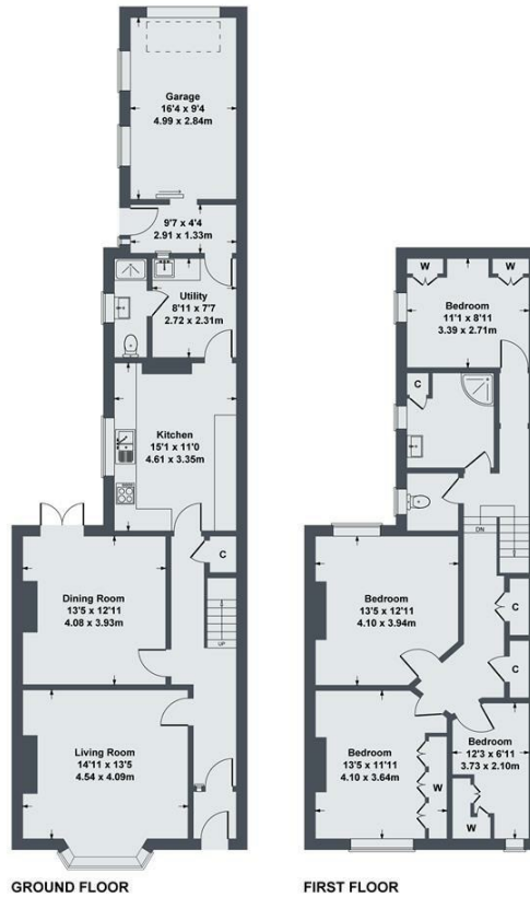
SKETCH PLAN FOR ILLUSTRATIVE PURPOSES ONLY All measurements walls, doors, windows, fittings and appliances, their sizes and locations, are approximate only. They cannot be regarded as being a representation by the seller, nor their agent. Produced by Potterplans Ltd. 2024

Approximate Gross Internal Area 1810 sq ft - 169 sq m