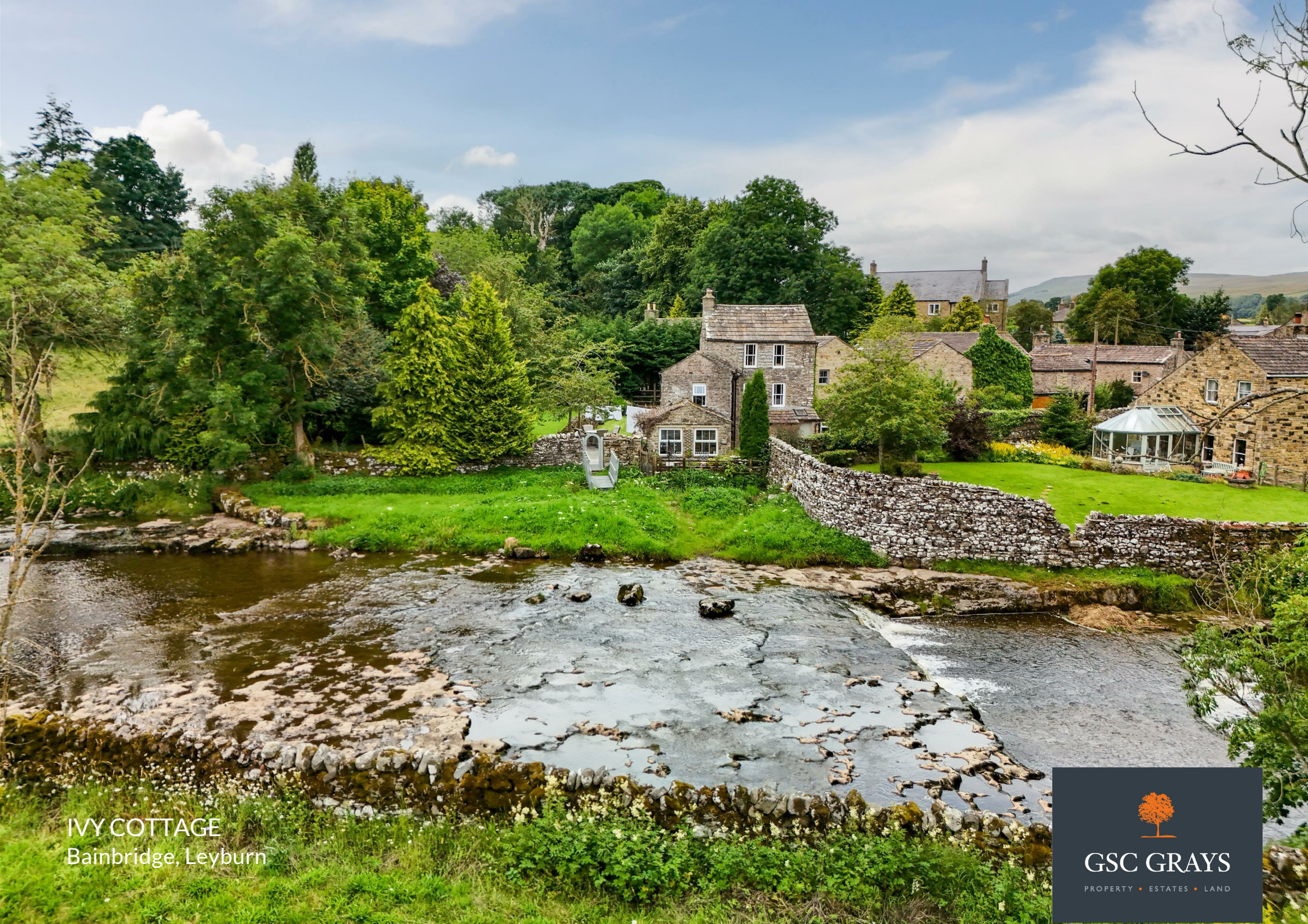
IVY COTTAGE Bainbridge, Leyburn