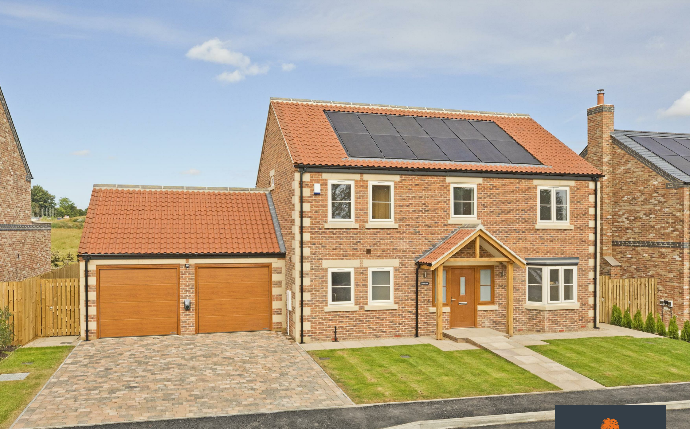
LAMBERT HOUSE, RASKELF ROAD Brafferton near Boroughbridge