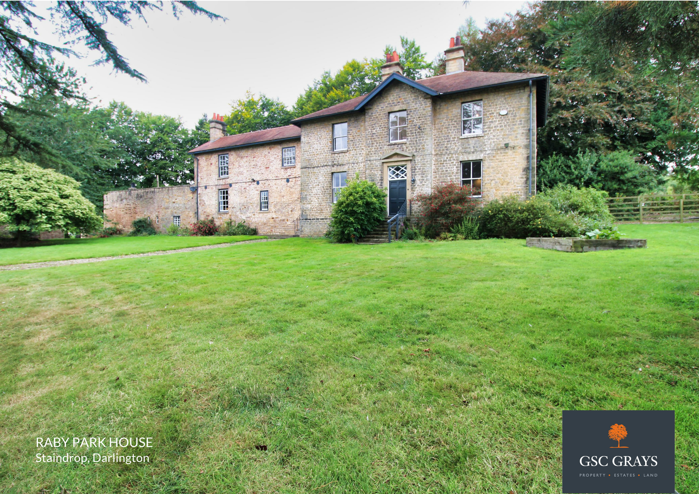
RABY PARK HOUSE Staindrop, Darlington