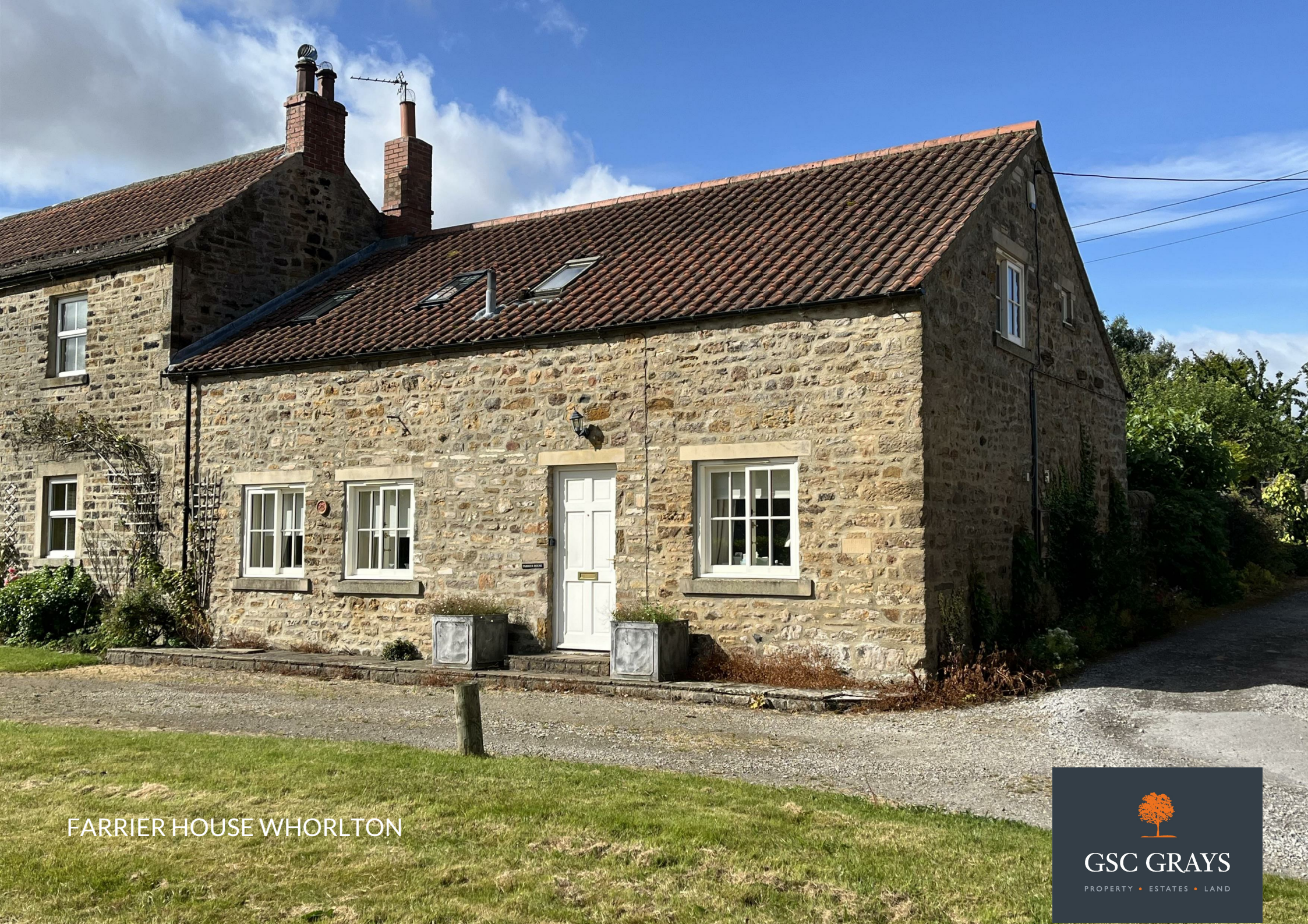
FARRIER HOUSE WHORLTON