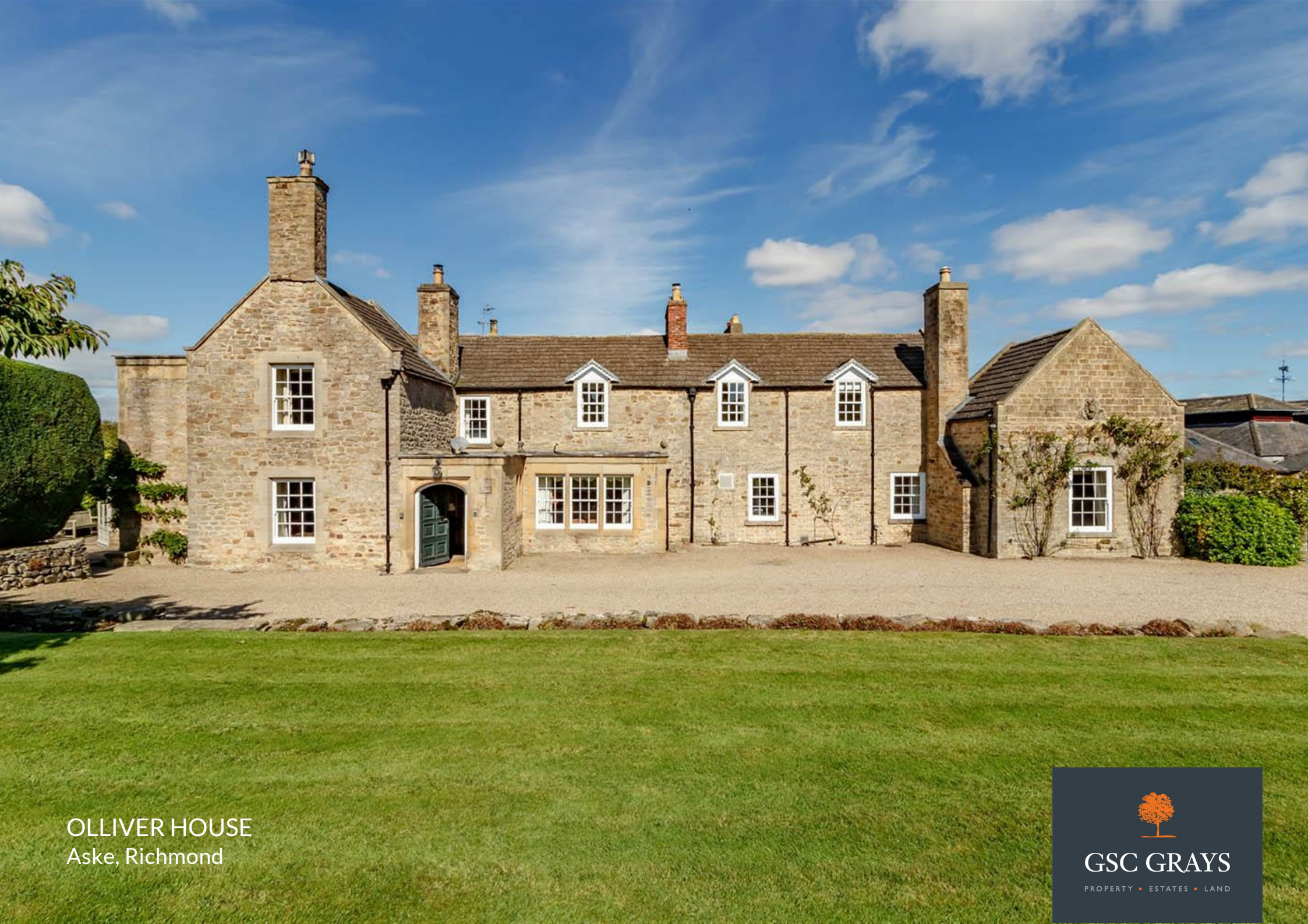
OLLIVER HOUSE Aske, Richmond