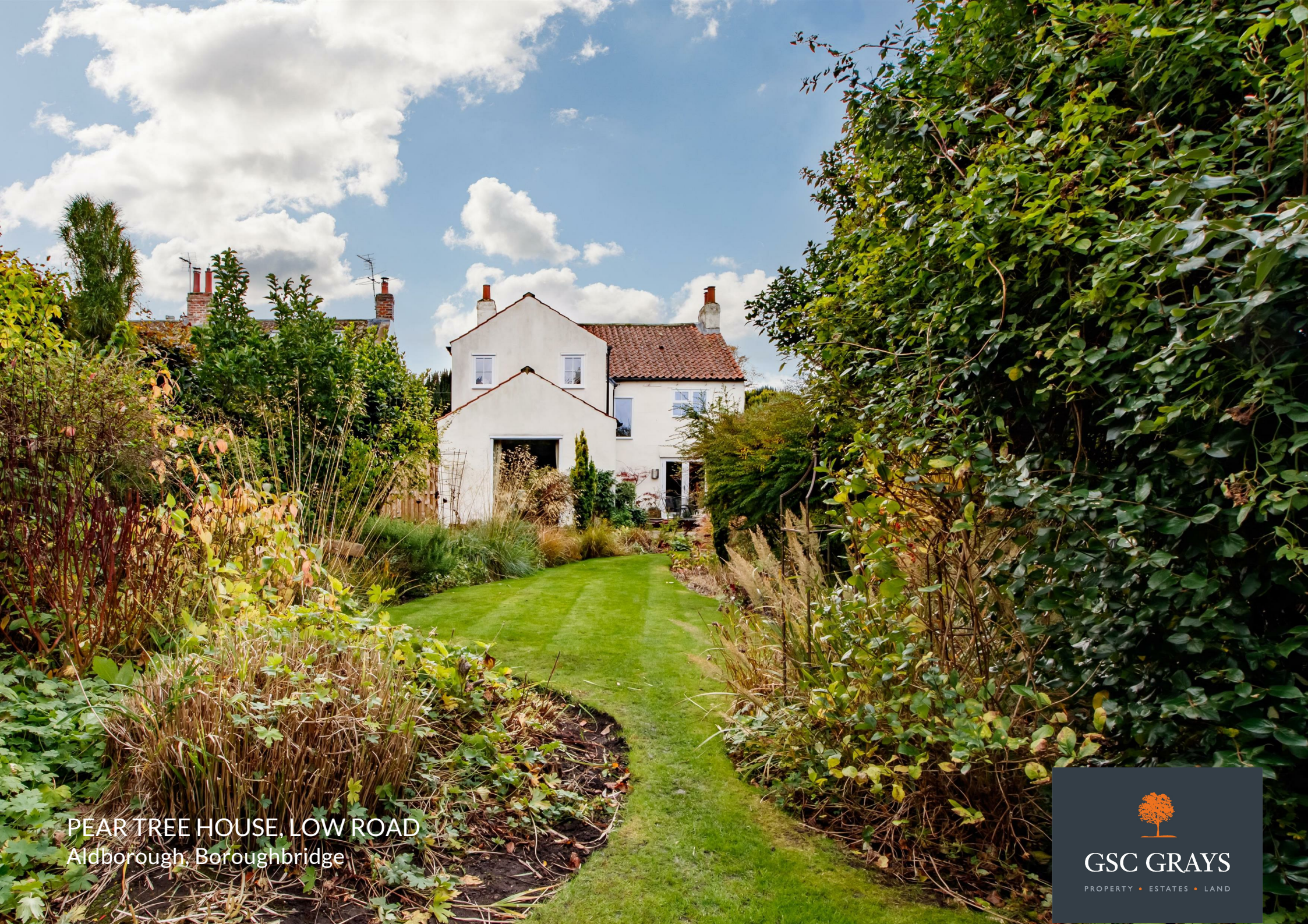
PEAR TREE HOUSE, LOW ROAD Aldbrough, Boroughbridge