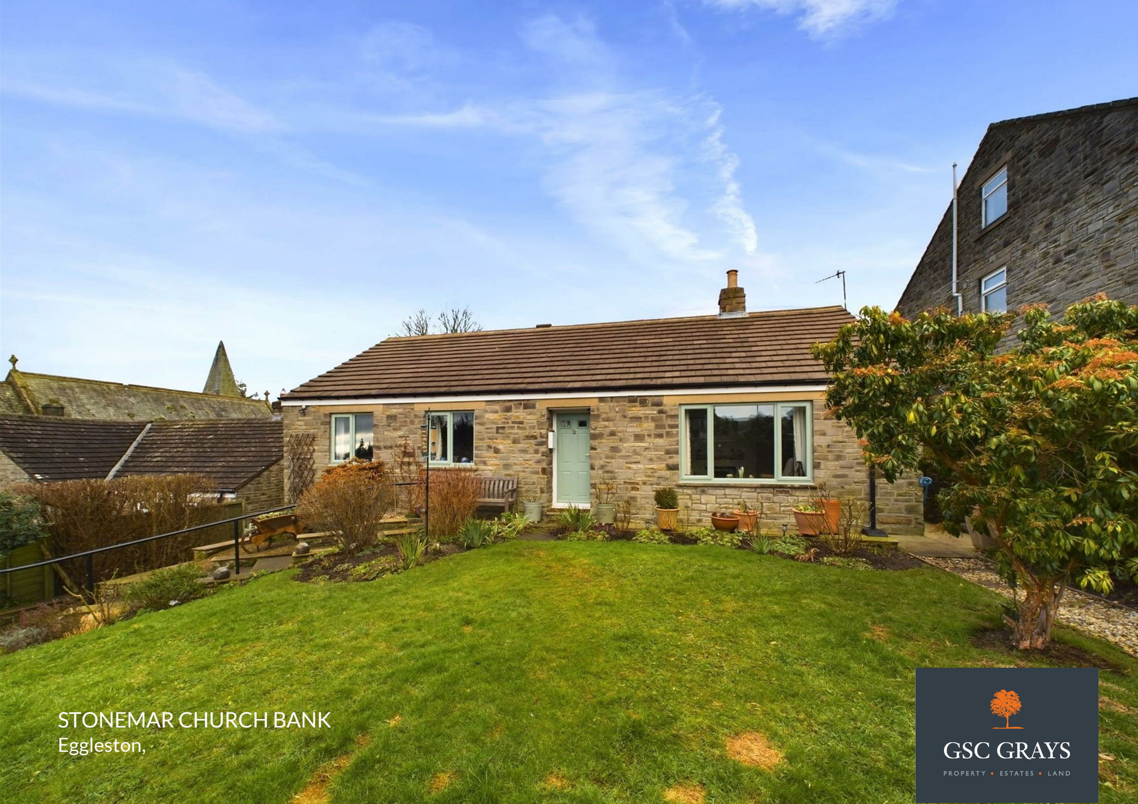
STONEMAR CHURCH BANK Eggleston,