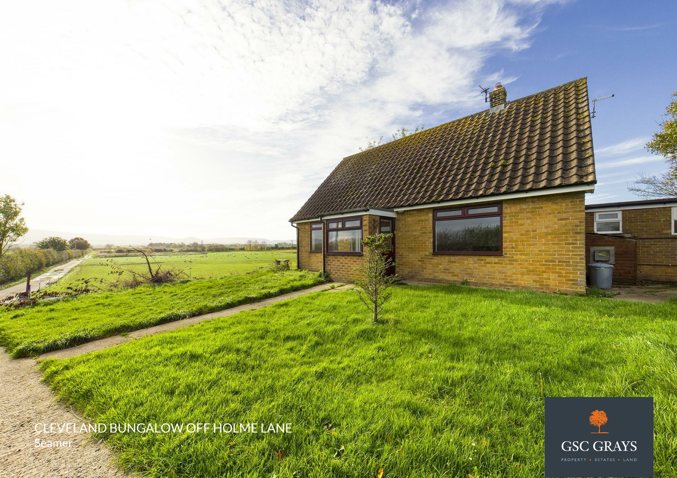
CLEVELAND BUNGALOW OFF HOLME LANE Seamer