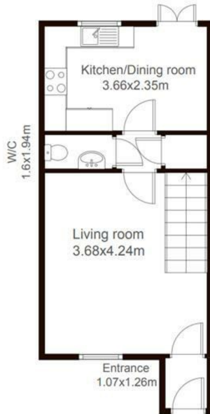
21 Pinewood Close, Newton Aycliffe