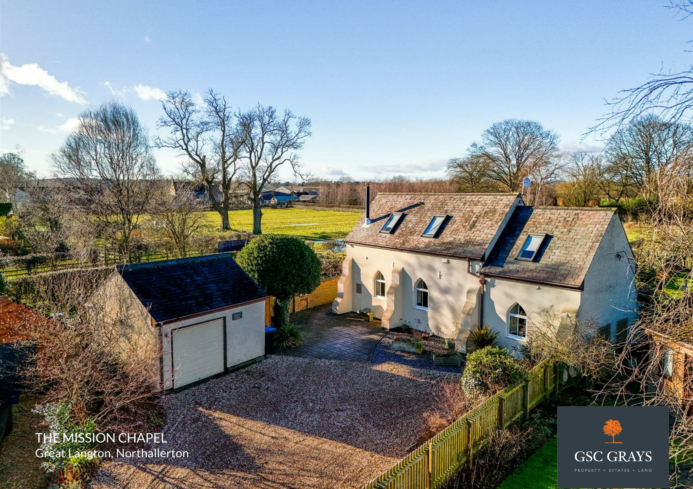
THE MISSION CHAPEL Great Langton, Northallerton