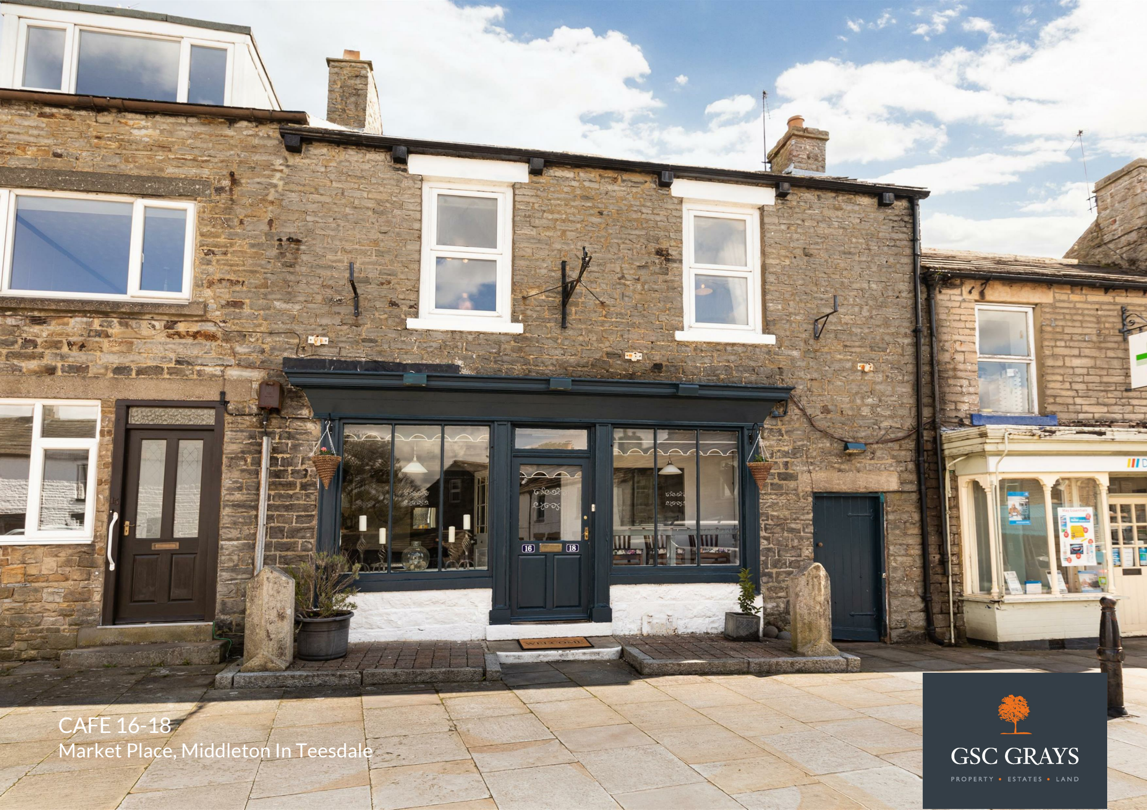
CAFE 16-18 Market Place, Middleton In Teesdale